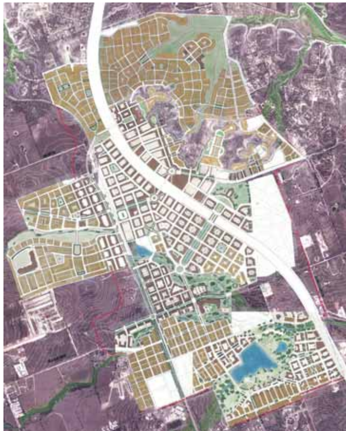
The Leander TOD Master Plan, courtesy of Gateway Planning Group, Inc.

system can create value. For example, a rail transit station's first effect on its surroundings might be an increase in land values due to great access, reliability and safety when the private sector reacts to an investment in TOD. The next effect can be the reduced demand for transportation services from the people living, working, shopping or otherwise enjoying the TOD. This type of land use redirects person-trips to transit, walking or shorter driving trips. Without the TOD, these person-trips would have caused more congestion, increased travel times and greater wear and tear on the transportation system.